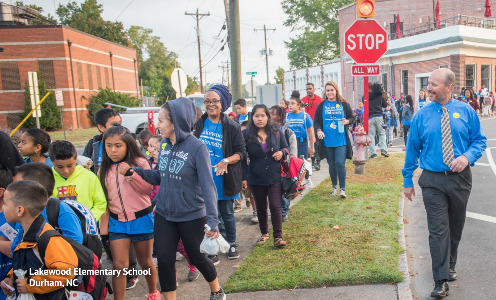
Lakewood Elementary School Durham, NC