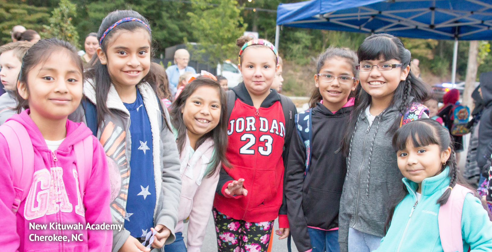
New Kituwah Academy Cherokee, NC