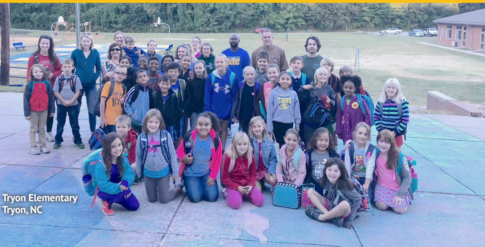
Tryon Elementary Tryon, NC